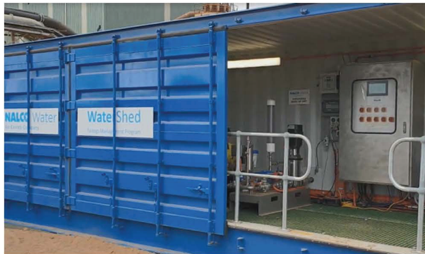
Figure 2. WaterShed infrastructure, which is stored in a containerised system for ease of implementation.

65% of water from the tailings as they enter the dam, and then returns the water to the plant for reuse.